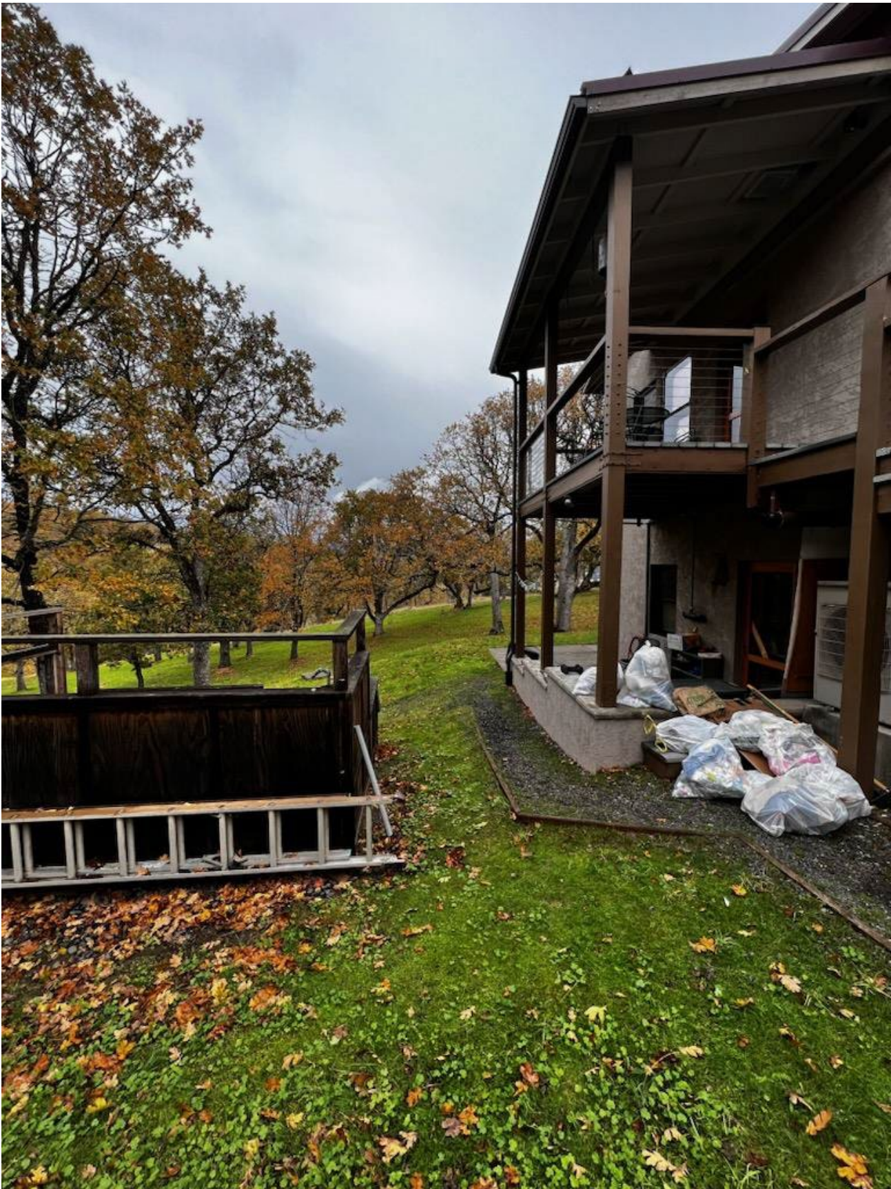
Side of the house where the water from the tanks will be plumbed. Pipeline will run along this side of the house.