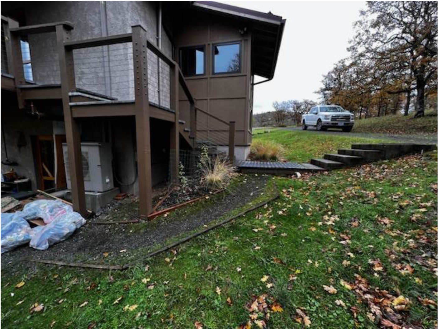
Front of the house where the water tanks will be plumbed to for use.