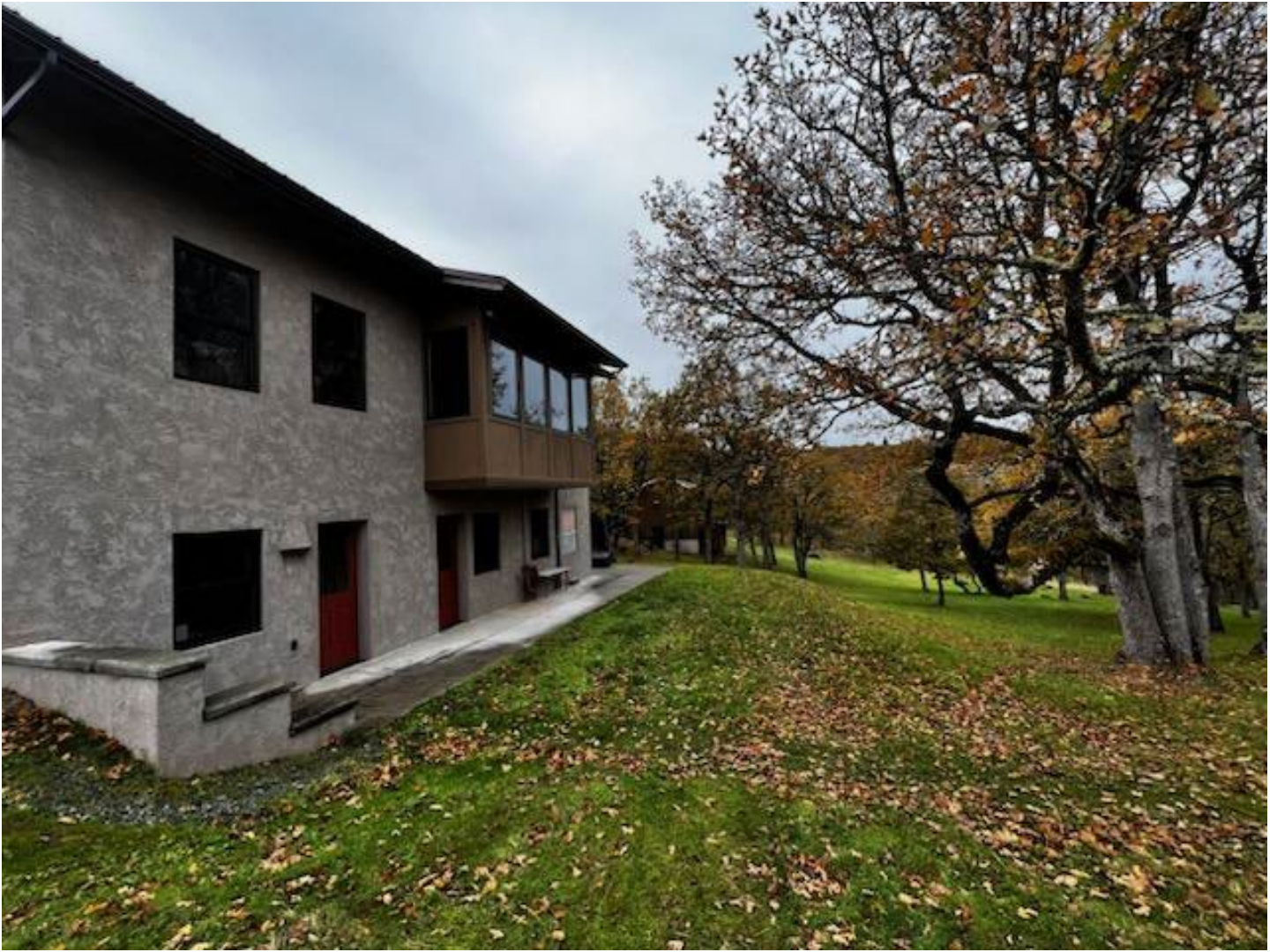
Back of house. Pipeline will run from the gutters on the left hand side, through the yard toward the trees where the tanks will be placed.