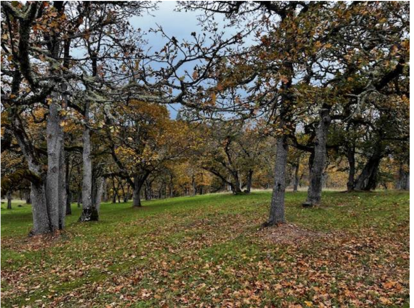
Tank location in the back of the house.