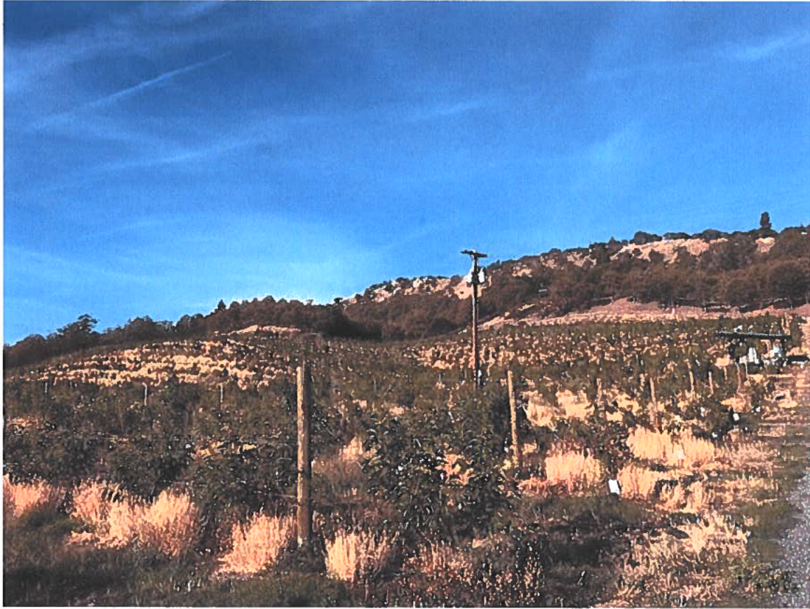
T. Dahle – Orchard Chipping Before Photos